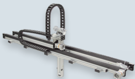
X/Z HD Robot

Motion so versatile, you won't believe it's linear. Available in 2 and 3 axis designs, Macron linear robotic systems are built to meet the specifications of any time, space, or size necessary to your unique application.